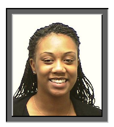
Good Female Photo

Below are examples of photos that will be approved.