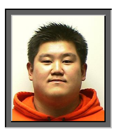
Good Male Photo

Photos including any of the following will not be allowed: